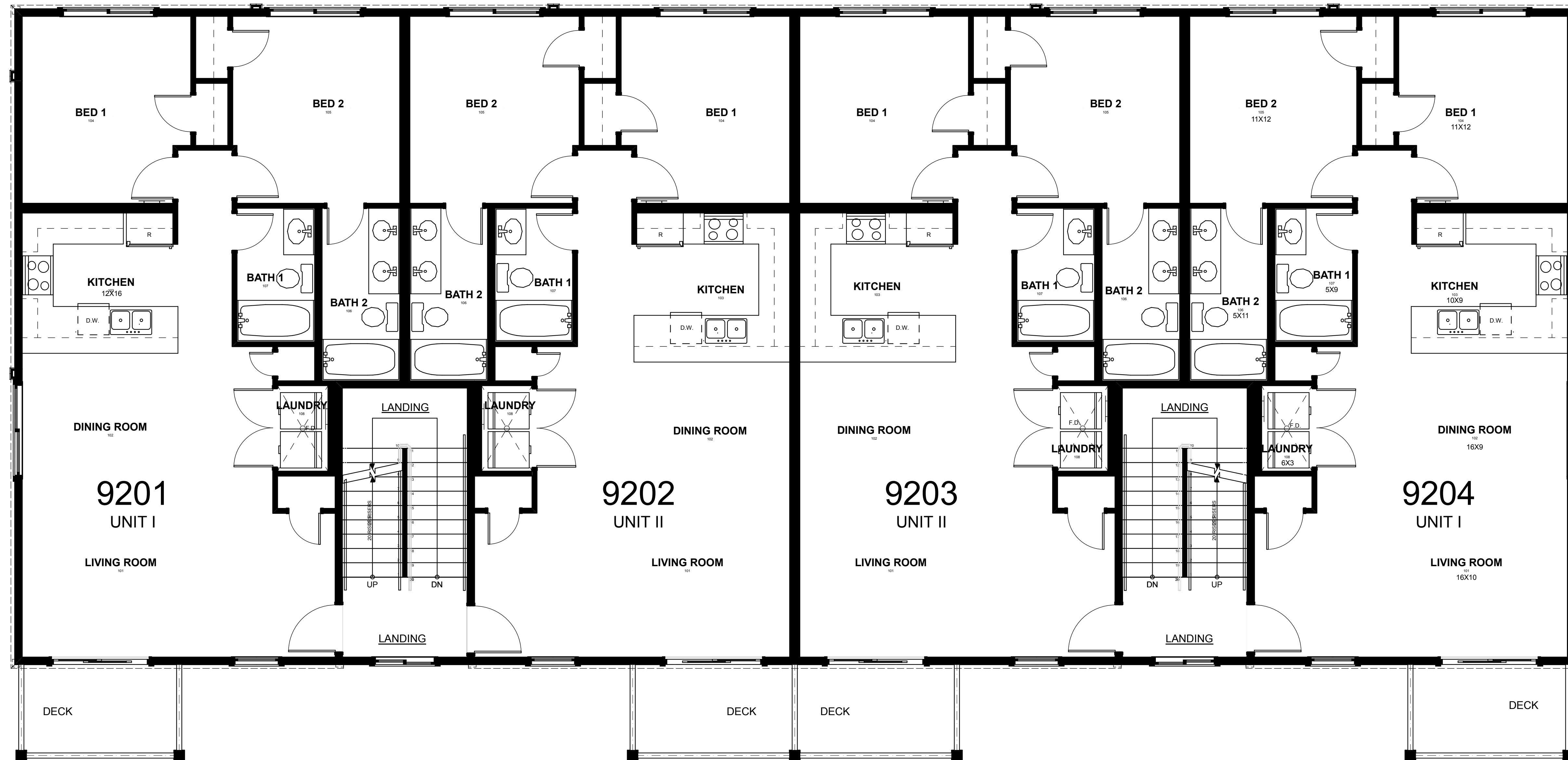
1 1ST FLOOR PLAN A-2 SCALE: 1/4" = 1'-0"